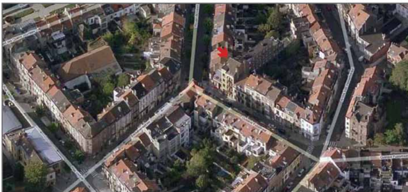
Rue Gustave Fuss 35 - 1030 Schaerbeek